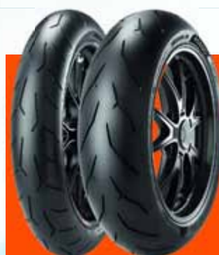
Pirelli Diablo Rosso Corsa